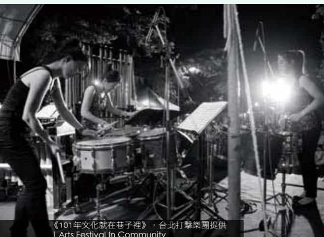
《101年文化就在巷子裡》， | Arts Festival In Community

Founded in 1986, Taipei Percussion grows with Taiwan for 27 years. Among the time, it rises as one of the prominent group in international stages and participates in international arts events with other professional performing groups and artists. For 14 consecutive years, it receives grants from Taiwan's Ministry of Cultural. In terms of music innovation, artistry in performing and recording techniques, it's certainly one of the most prominent groups in Taiwan.