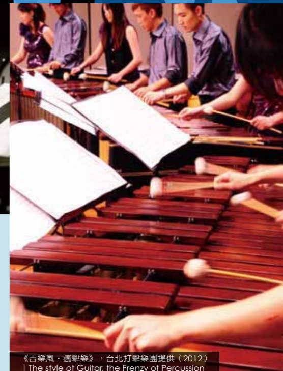
《吉樂風·瘋擊樂》（2012） | The style of Guitar, the Frenzy of Percussion