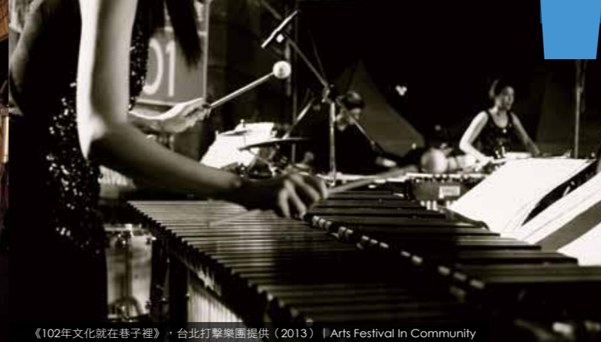
《102年文化就在巷子裡》，台北打擊樂團提供（2013）| Arts Festival In Community