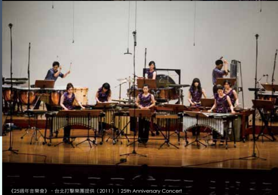
《25週年音樂會》， | 25th Anniversary Concert