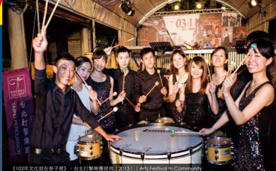
《102年文化就在巷子裡》（2013）| Arts Festival In Community